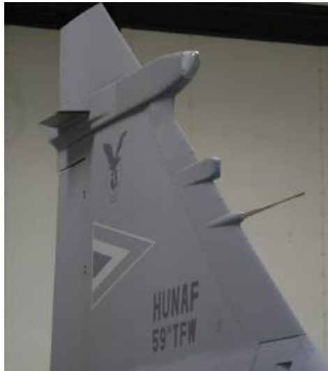
Fig. 5. Rear-antenna for the EW System [45]

The Hungarian JAS-39 version has an advanced Internal Jammer with forward and rear antennas and 4 passive counter-measures dispensers. The jamming system is able to provide different types of jammings. The dispensers are located on the upper and on the lower side of the aircraft to ensure the dispersion into the upper or lower airspace. The dispensers work based on the program, uploaded into the EWCU by the support team. Based on the possible danger, it is possible to load into the dispensers chaff and flare as well on the ground. The dispensers are manufactured based on the NATO standards and can be filled with different size of ammunition. [46][47]