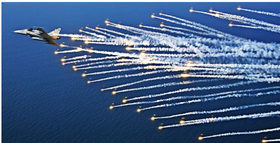
Fig. 6: JAS 39 Gripen with flares [48]

The Hungarian JAS-39 version has an advanced Internal Jammer with forward and rear antennas and 4 passive counter-measures dispensers. The jamming system is able to provide different types of jammings. The dispensers are located on the upper and on the lower side of the aircraft to ensure the dispersion into the upper or lower airspace. The dispensers work based on the program, uploaded into the EWCU by the support team. Based on the possible danger, it is possible to load into the dispensers chaff and flare as well on the ground. The dispensers are manufactured based on the NATO standards and can be filled with different size of ammunition. [46][47]