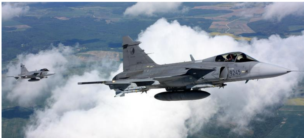
Fig. 2: A two-ship formation of Czech Air Force JAS-39 over the Balticum. [21]

“The air assets deployed on the mission maintain a permanent readiness posture to scramble at short notice and take deterrent of other actions against the trespassers on 24/7 base.” In February 2013 the North Atlantic Council approved the lengthening of the Baltic Air Policing mission instead of the scheduled 2014 finishing. [19] Hungary announced in 2012, during the NATO meeting in Chicago, that between 2015 and 2018 the HUNAF can participate in this mission. [20]