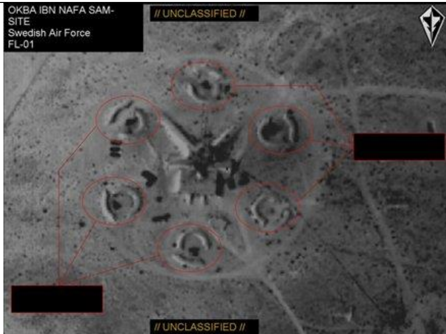
Fig. 1. Recon photo in Libya [8]

The Gripens were deployed to the Sigonella base, designed as a naval air force base. They met the first problem here concerning the fuel, because the US navy aircraft use different sort of fuel. [9]