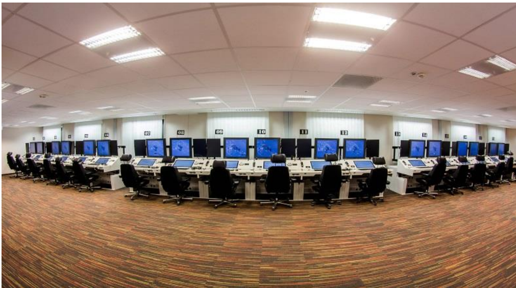
Figure 2. Real-Time Simulator platform at HungaroControl. The platform encompasses 34 controller and 27 pilot working positions with advanced ATM tools and applications, System Coordination and Data-Link environment.

However, if the operator is exposed to the same environment and only slight modification occurs (seeing the same traffic sample but with three different procedures), the learning effect will influence his/her performance. Consequently, close attention must be paid on the number of levels a variable may have. The main issue in large scale RTS compared to lab experiment is that there is less chance to randomize the conditions. In lab experiments one participant will start with the first condition, while another participant starts with the second, etc. In large scale RTS, all ATCOs are participating at the same time, thus randomization is not viable. A plausible solution for randomization would be to have one more traffic sample with similar occupancy. However, adding more variables will influence the length of the simulation, which is again a critical factor in RTS from resource and cost perspective. Therefore, it is recommended to select the most intriguing variables that have only two levels and have at least two traffic samples minimizing the learning effect.