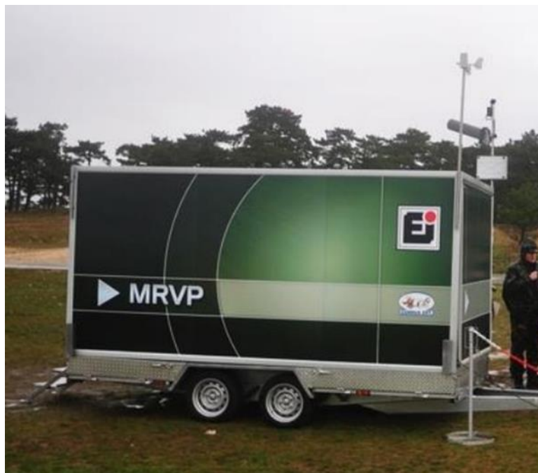
Figure 9. Deployable command centre [20]

Due to the technical evolution of the last decades this issue is topical again, because unmanned aerial systems went through a great evolution and continuous improvement, even turbulent. Several types exist, such as fixed wing, rotor driven and even flapping-wing (ornithopters). One type can fly faster than the speed of sound, one weighs only a few grams and one is capable to depart with several tonnes of take-off mass, one can only fly a few hundred meters from its base of operation and other types are capable to fly across the continents. They can fly autonomously or can be remotely controlled by a human, or it can be a combination of both. Common feature of these constructions is the necessary presence of technical personnel [7].