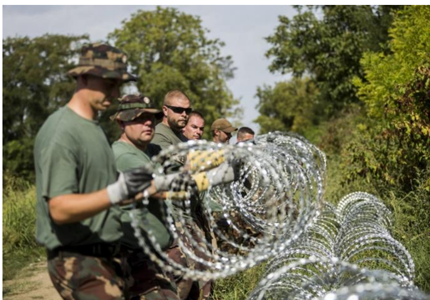
Figure 6. construction of Temporary Border Fence started on the Hungarian border [17]

(NATO standards) barbed wire to achieve the desired result. In addition, under the command of police forces, units of the Hungarian Defence Forces started also to patrol together with the police. The implementation of border defence tasks consisted of 3 main duties. These were technical (vehicle) and infantry patrols, high-stand observation and air patrolling. In parallel with the establishment of this technical border barrier the construction of an additional three meters high wired fence also started to strengthen the defence capabilities of the already deployed first defence line. This defence line was called Temporary Border Fence (TBF). There was also a need to modify the legislative environment in force, because, according to Hungarian law, crossing or destroying the technical border barrier was only an administrative offence. On 4 September 2015, the National Assembly of Hungary adopted law CXL 2015, whereby the destruction or illegal crossing of the technical border barrier constitute a criminal offence which may be sanctioned with immediate expulsion.