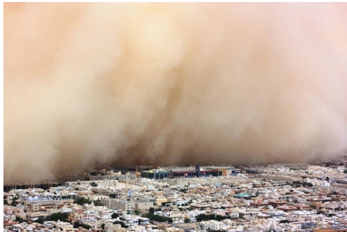
Fig. 2. Sandstorm over Baghdad

If we think on the Iraq war when examining the limitations of applicability we have to remember the practically everyday sandstorms (Fig. 2) that actually paralysed the targeting of the laser-guided bombs of the allied forces.