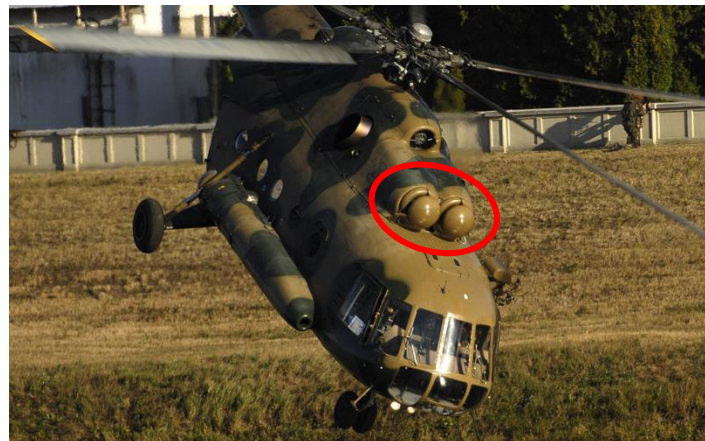
Fig. 5. PZU dust separator on Mi-17 transport helicopter

Engineers designing engines have developed several technical solutions in order to maintain engine efficiency. Among them are dust separators applied specifically on helicopters (Fig. 5).