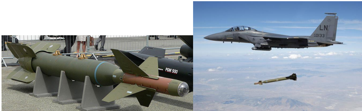
Fig. 3. GBU-28 laser-guided bomb, and its release from an F-15 of the U.S. Air Force 12

clear therefore that the target has to be continuously illuminated during the flight of the laser-guided bomb (Fig. 3), the aircraft may not perform significant flight manoeuvres during this time and nothing may distract its attention from performing the mission.