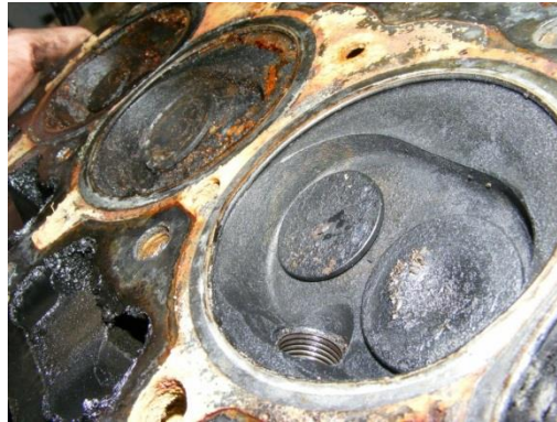
Fig. 6. Corrosion on the cylinder head of a combustion engine

It should be noted however, that in case the system is not properly maintained/sealed or if the operation of the engine cannot be regarded as continuous, furthermore if the engine compartment or the engine bay is not properly protected from precipitation than the effect of corrosion is significant (Fig. 6).