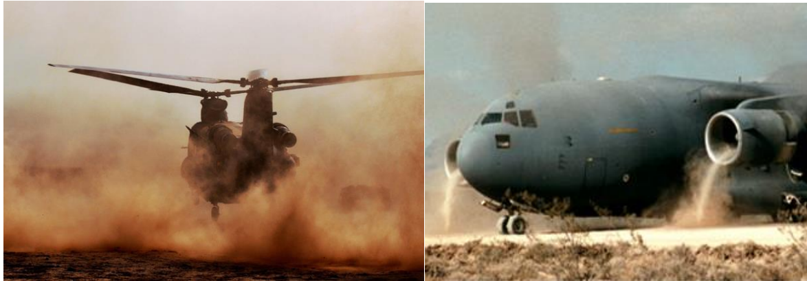
Fig. 4. Operation of aircraft gas turbines under desert conditions

The question might arise: what causes the reduction of blade length 14 ? The main reason is the sand (grains of sand) sucked into the engine (Fig. 4).