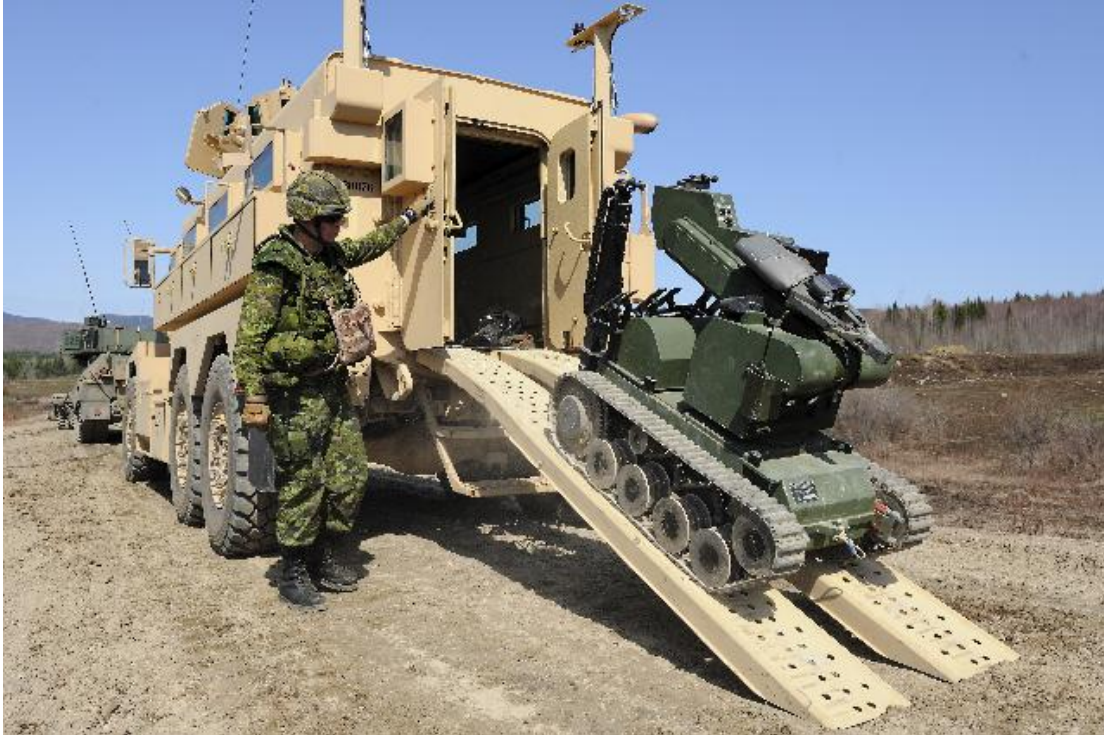
Picture 4. 'De-mining' robot deployed, Prevention Robot.

Within the Military Robotics Driver Matrix the Assault Robots are clearly the top notch, most visible group of the matrix. These robots combine maximum impact on (saving) human life while maximizing the economic benefits of using robots for the designed operational task. The whole range of Unmanned Aerial Vehicles (UAV) fits this segment.