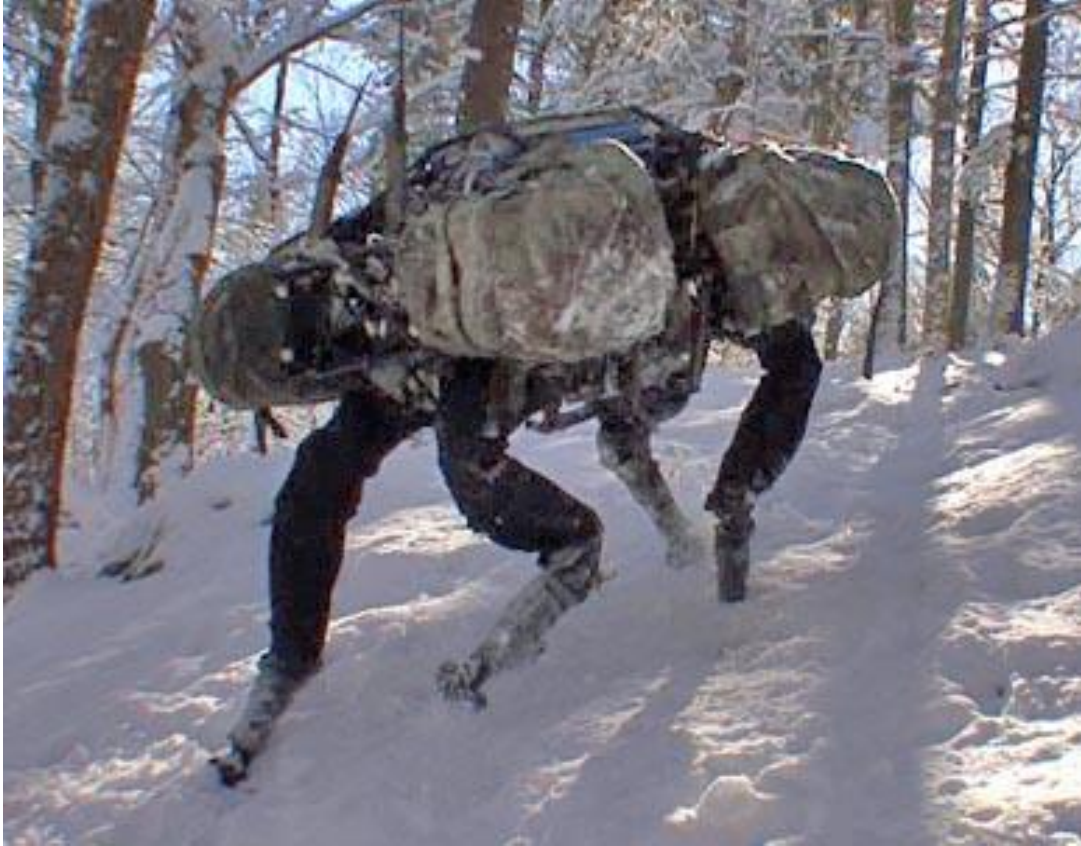
Picture 3. 'Big Dog' by Boston Dynamics, Logistics Robot.

The Military Robotics Driver Matrix shows the Prevention Robots segment. This group of robots contains automation designed to typically keep humans out of harm's way while the economic impact of these robots is minimal.