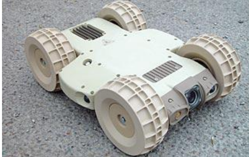
Picture 2. Dragon Runner, Reconnaissance war-bot.

If we extend the scale of the economic impact on the Military Robotics Driver Matrix we end up in the Logistics Robots quadrant. The Logistics Robotics segment discriminates itself from mere reconnaissance tasks through the larger economic effects realized while keeping the human impact objective low. Unmanned cargo helicopters like the K-Max [6], developed by Lockheed Martin and Kaman Aerospace, to (re)supply outposts in dangerous or difficult penetrable terrain can be named in this effect.