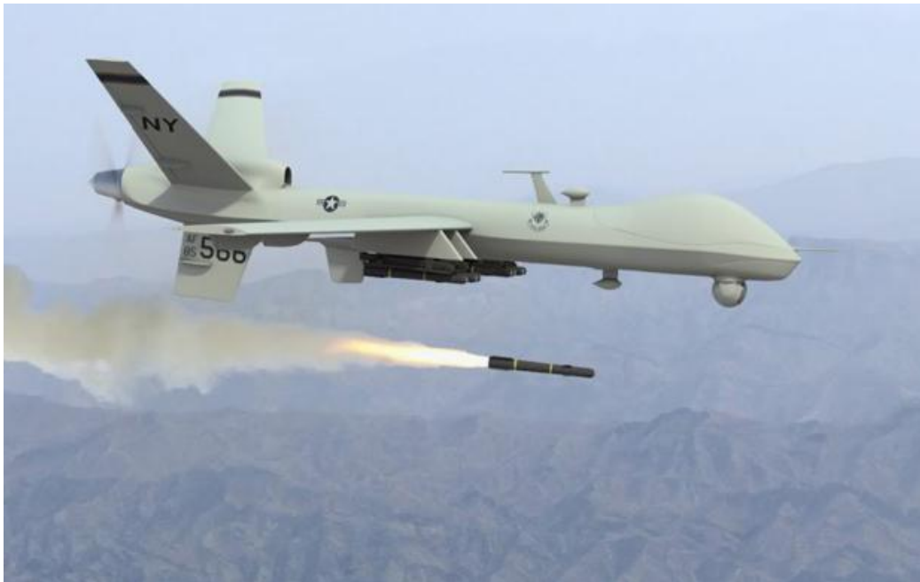
Picture 5. Predator UAV firing Hellfire missile. Assault robot.

Equipped with C2 software /hardware and various communications systems. They have semi-autonomous navigation and mission equipment operations. Fire authorization is handled via C4ISR network where humans are in control [11].